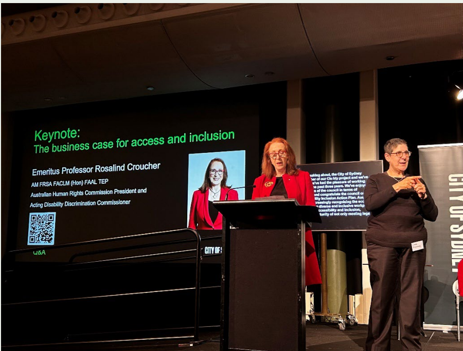
Good access is good for business breakfast.